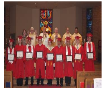
Christ the King High School Class of 2009